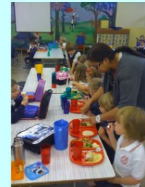
What if I need help?