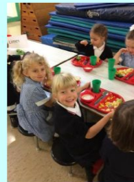
Friends sitting together