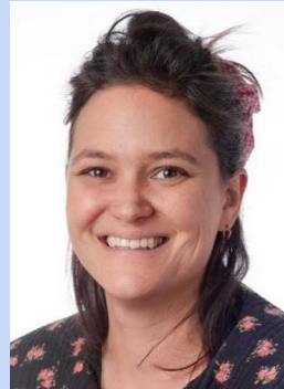
Opal Class M/T