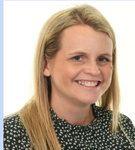
Opal Class W/Th/F