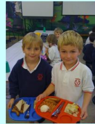
Now, where shall I sit?