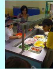
Salad, fruit and yoghurt