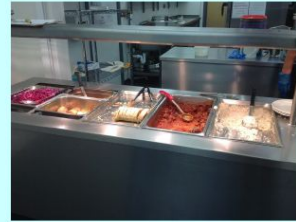
Making a choice